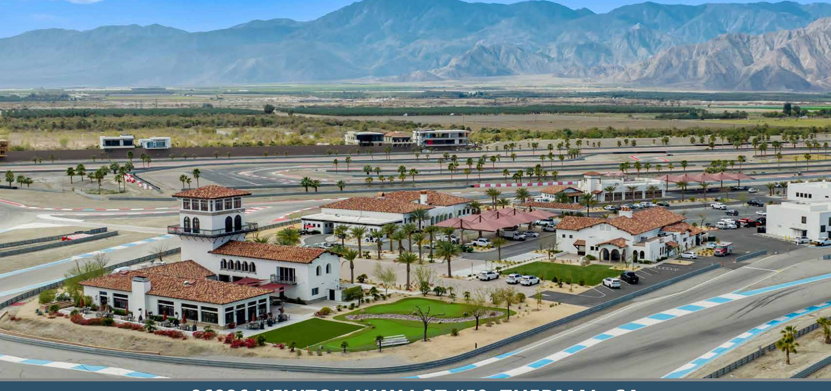
86886 NEWTON WAY LOT #59, THERMAL, CA