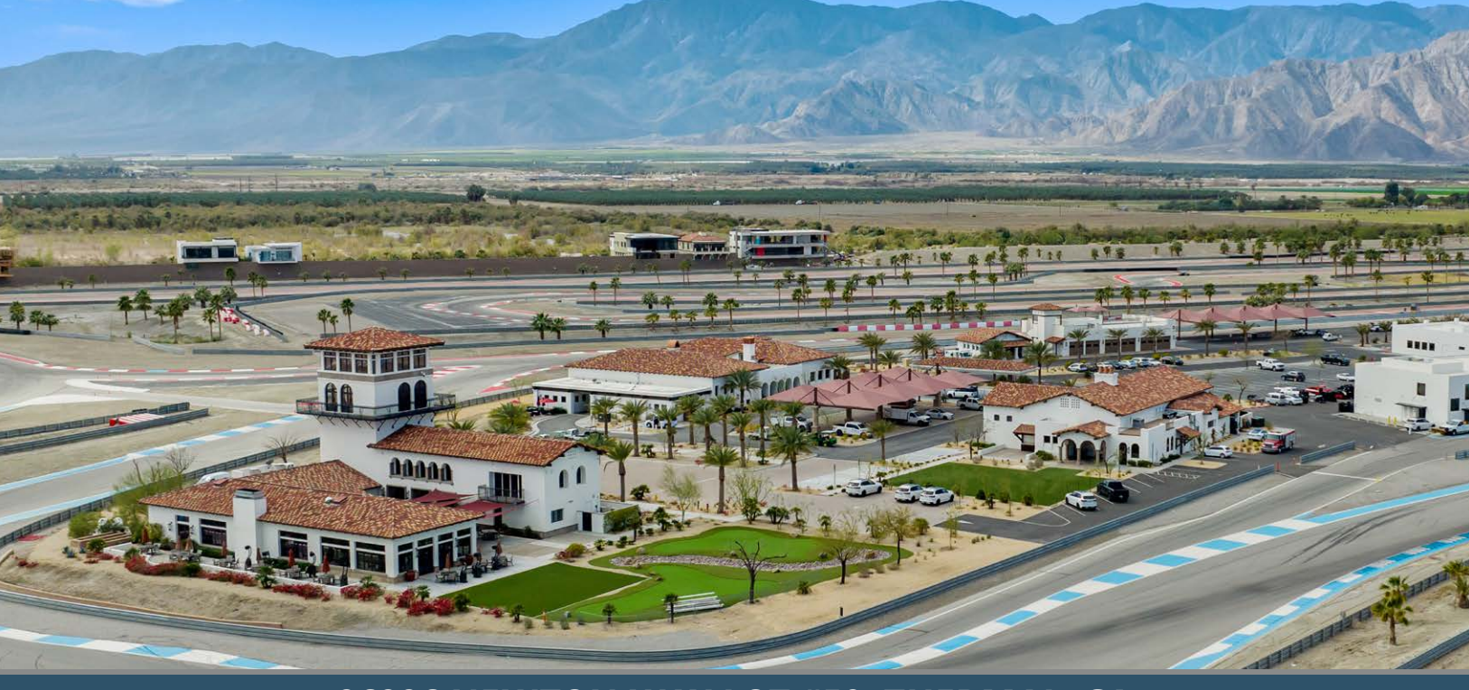
86886 NEWTON WAY LOT #59, THERMAL, CA